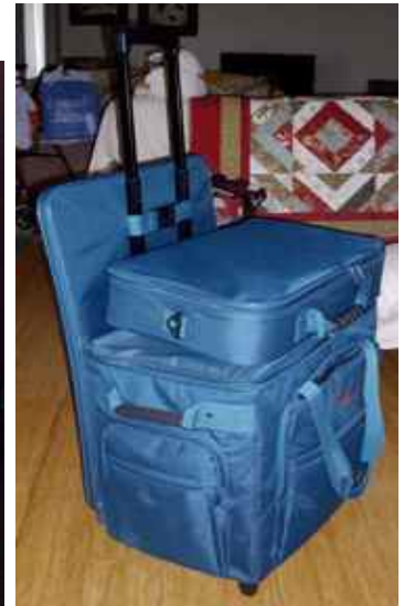
3 piece reinforced trolley case $100

In addition to these items there are also many quilting aids and fabric. If you would like to see what is on offer please call me on 5979 3770