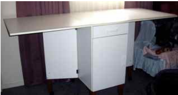
Cutting Table with drawer and cupboard $200

Due to health reasons I am no longer able to sew, and will be disposing of many patchwork related items. See below: